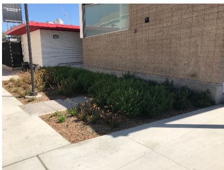
North of Building F- Landscape area will be replaced with concrete paving