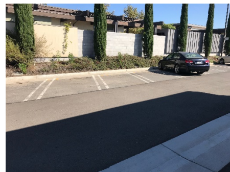
West of CDC Building- New striping of parking stalls