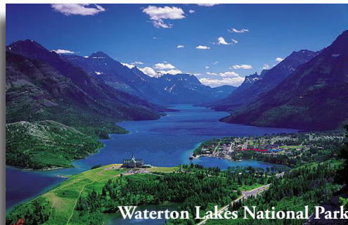
Waterton Lakes National Park

Idaho's beautiful Silver Valley we soon arrive in the historic mining town of Wallace, Idaho (population 784). The town has long been famous as the "Silver Capital of the World" – the only place on earth where more than a billion ounces of silver have been mined in 100 years. But the town is also famous because every downtown building is on the National Register of Historic Places. Enjoy time at your leisure in Wallace for lunch and browsing. We continue on this afternoon and arrive in "Big Sky Country" as we travel along the western shore of Montana's Flathead Lake. Arrive in Whitefish, Montana – surrounded by three distinct mountain ranges it has a proud history and a rich timber and railroad heritage. Walk through town and discover the floral window boxes, hand-carved wooden signs, covered sidewalks, painted murals, and old-time building facades as you shop or dine at leisure. Or relax at our accommodations for the evening – the upscale Grouse Mountain Lodge featuring rustic luxury and nestled in the heart of a mountain valley. (Breakfast)