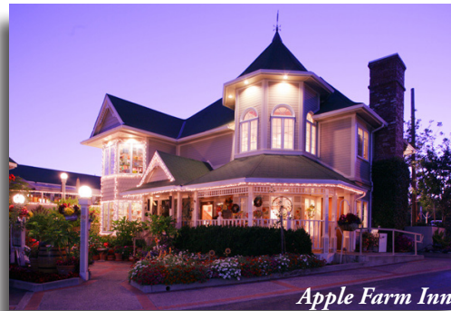
Apple Farm Inn