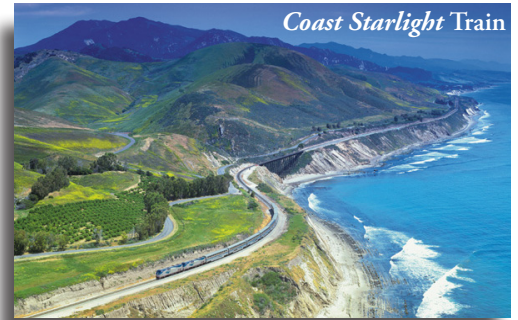
Coast Starlight Train

Embark on a relaxing three-day getaway to explore California's Central Coast during a delightful time of year while enjoying a stay at the quaint Apple Farm Inn . We'll travel by train, explore the backroads and sample the local fare as we keep a relaxed pace and get a first-hand look at what makes the California Coast so special.