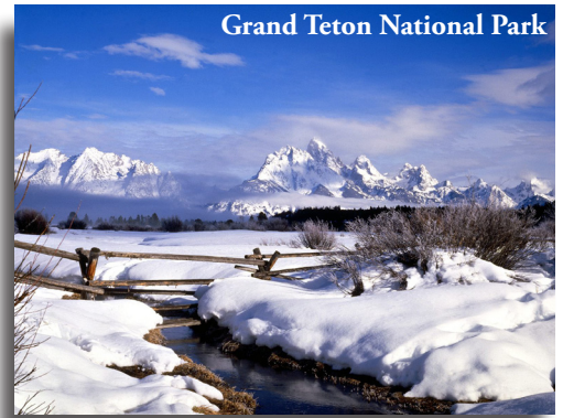
Grand Teton National Park

Olympic Games and continues to host World Cup events. We will see the Nordic Jumps along with the Bobsled and Luge Track – the fastest on Earth! Tonight join the group for a farewell dinner at a local favorite. (Breakfast, Dinner)