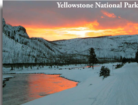
Yellowstone National Park

bubbling mudpots – a land so amazing that the first explorers to bring back tales of Yellowstone were called liars. Visit some of Yellowstone's most famous highlights, including Firehole Falls and the geyser known world-wide as Old Faithful – a fountain of steam that faithfully rises more than 60 feet in the air. After a full day of scenic beauty, we continue on south through Yellowstone and on into Grand Teton National Park , where you will see America's youngest and most rugged mountains, the Teton Range. Enjoy the spectacular scenery as you journey to Jackson where we check in for a two night stay. Dinner is included this evening in the old west town of Jackson . (Breakfast, Dinner)