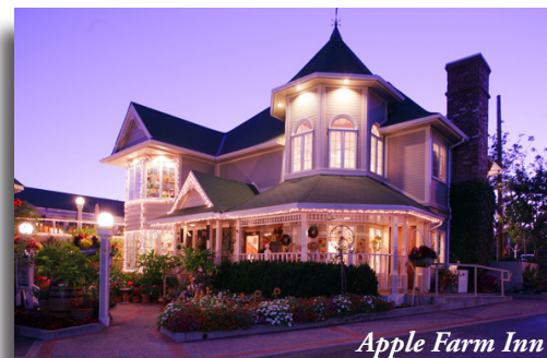
Apple Farm Inn

restaurant. You also have the option of going to the San Luis Obispo's open-air Farmers' Market which fills four blocks of historic downtown. Buy just-picked produce and sample a variety of barbecued specialties from local restaurants or stroll the many booths while you are entertained by local performers.