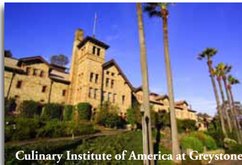
Culinary Institute of America at Greystone

wineries. Experience an included gourmet lunch aboard the lavish Napa Valley Wine Train as it travels through the heart of the Napa Valley. The Wine Train wouldn't be right without some wine tasting and we'll enjoy some tasting at the train depot before departure. This afternoon we'll take a docent-guided tour of the Culinary Institute of America at Greystone and enjoy time at leisure in the quaint town of St. Helena . This afternoon we'll visit an olive oil farm and learn about the olive oil-making process and taste the different oils. Our final stop of the day will be in the historic town of Sonoma . Enjoy dinner on your own this evening at one of the restaurants surrounding the historic town plaza – a remnant of the town's Spanish colonial past. (Breakfast, Napa Valley Wine Train Lunch)