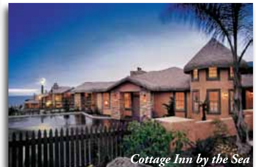
Cottage Inn by the Sea

by ocean breezes combine to make California's Central Coast a prime grape-growing region. There are more than 25 different varieties of grapes and more than 100 wineries in the Paso Robles wine region – the fastest growing wine region in California. Today, we'll visit perhaps the most spectacular! Sometimes you have to dig deep to get to the bottom of things...and at Eberle Winery , you'll have to go 35 feet underground to do it. Enjoy an included lunch, tasting and tour of Eberle's caves – 16,000 square feet located below the winery where every bottle of wine made here is aged. We continue the short distance to Pismo Beach . Known as the "Clam Capital of the World," Pismo Beach preserves the spirit of early California with its 23 miles of unspoiled sandy beaches including Pismo's dramatic rugged coastlines and the 1,200 foot Pismo Beach pier. We'll enjoy an overnight stay at a charming beachfront hotel with fireplaces in every room. This evening enjoy an included and memorable farewell dinner with your fellow travelers at the eclectic Madonna Inn . The timeless elegance and whimsical décor of this California landmark has intrigued visitors for more than 50 years. (Breakfast, Lunch, Dinner)