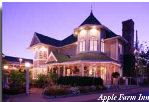
Apple Farm Inn

Start your day with an included breakfast at the hotel prior to our journey to the famous Napa Valley – one of the most widely recognized wine regions in the world. Vineyards have been part of the landscape here for more than 150 years and today this valley is home to more than 260