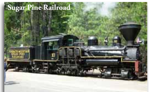
Sugar Pine Railroad