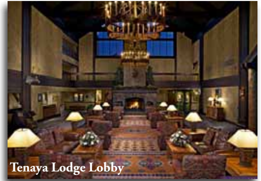
Tenaya Lodge Lobby

After meeting at our departure points this morning, we set off on our journey towards Yosemite National Park. Following a morning rest stop and an included lunch in the Central Valley, in the late afternoon we will arrive at the beautiful mountain retreat, the Tenaya Lodge at Yosemite . Located just outside the south entrance of Yosemite National Park, this lodge is a classic mountain resort surrounded by a noble evergreen forest and offering an experience that is classic, yet perfectly modern. The property offers an indoor pool and spa and full service spa. This evening relax at the hotel and enjoy dinner at leisure at one of the hotel’s three restaurants. (Lunch)