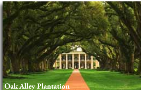
Oak Alley Plantation