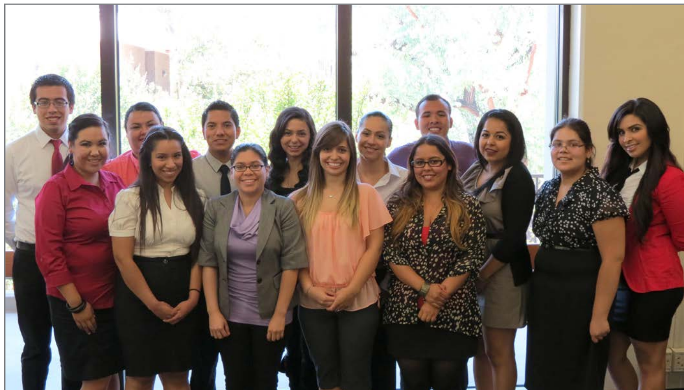
Students at the Summer Research Scholars program held in July 2012.