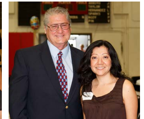
Pictures of our generous scholarship donors and their student recipients taken at our Scholarships & Awards Ceremony on Friday, May 11, 2012.

It is a special moment when a scholarship recipient actually gets to meet the donor that will help make it possible for them to continue their education, either at Santa Ana College or at a four-year institution.