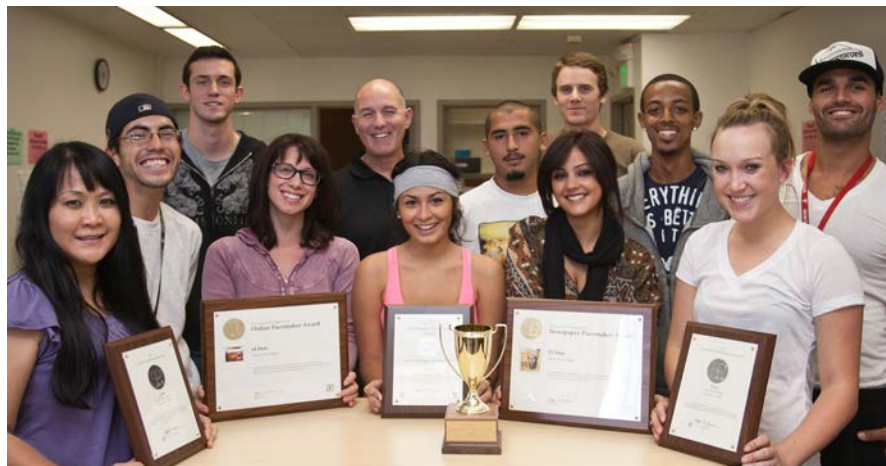
PICTURED ABOVE: (Left) President's Circle Recipients El Don Student Newspaper Staff, (Right Column) Fall 2011 President's Circle Event.