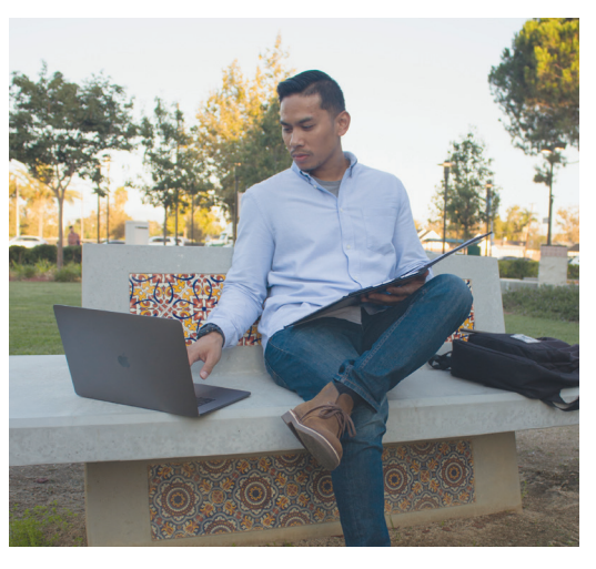
Making classes more accessible to students