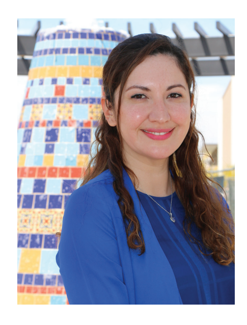
This award recognizes an individual who is "nearly indispensable" and who demonstrates sensitivity, dedication, resourcefulness, positive attitude and enthusiasm.